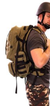
3 DAY BAG

The 3 Day bag is designed specially for short duration use. It has multiple compartments with zip closures and an internal hydration system. There are 4 pockets on the outside of the bag and a total of 8 internal pouches and 2 mesh pockets. The 3 day bag also has a facility for an internal hydration system.