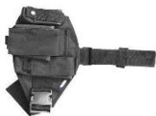
HOLSTER LEG RIG