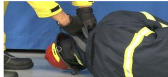
Structural Fire Turnout suit with Drag handle