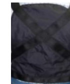
CAMELBAK HYDRATION PACK