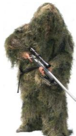
LIGHTWEIGHT GHILLIE SUIT

The leg bag is designed specifically to hold the rope system used by parachuters, and is designed to fit around the leg with a hook and loop closure. The bag also incorporates a foot loop. The internal wall has loops which the user can load his rope system. The bottom is detachable for quick releasing of equipment.