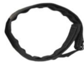
KNEE & ELBOW PADS